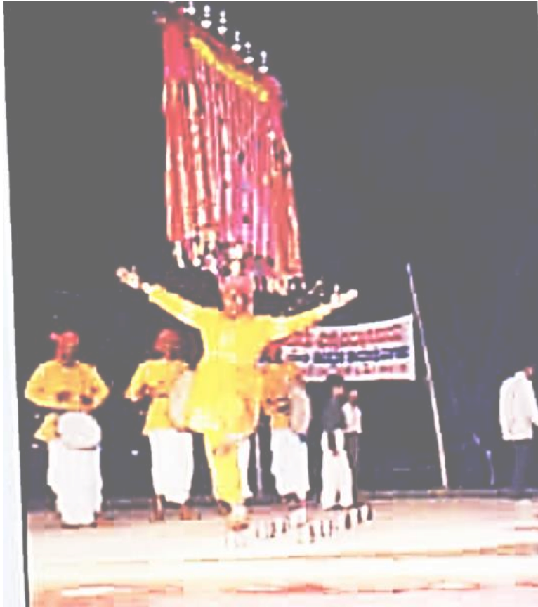
20 years ago