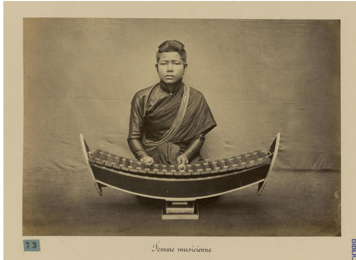
Plate-3 Roneat dek : A metaloph- one of brass keys

Plate-1 Roneat ek : The lead xylophone with bamboo or teak wood keys